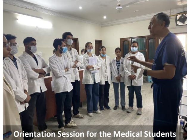
Orientation Session for the Medical Students