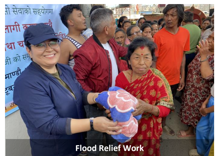
Flood Relief Work