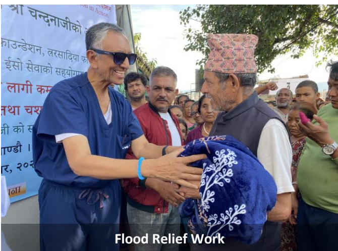
Flood Relief Work