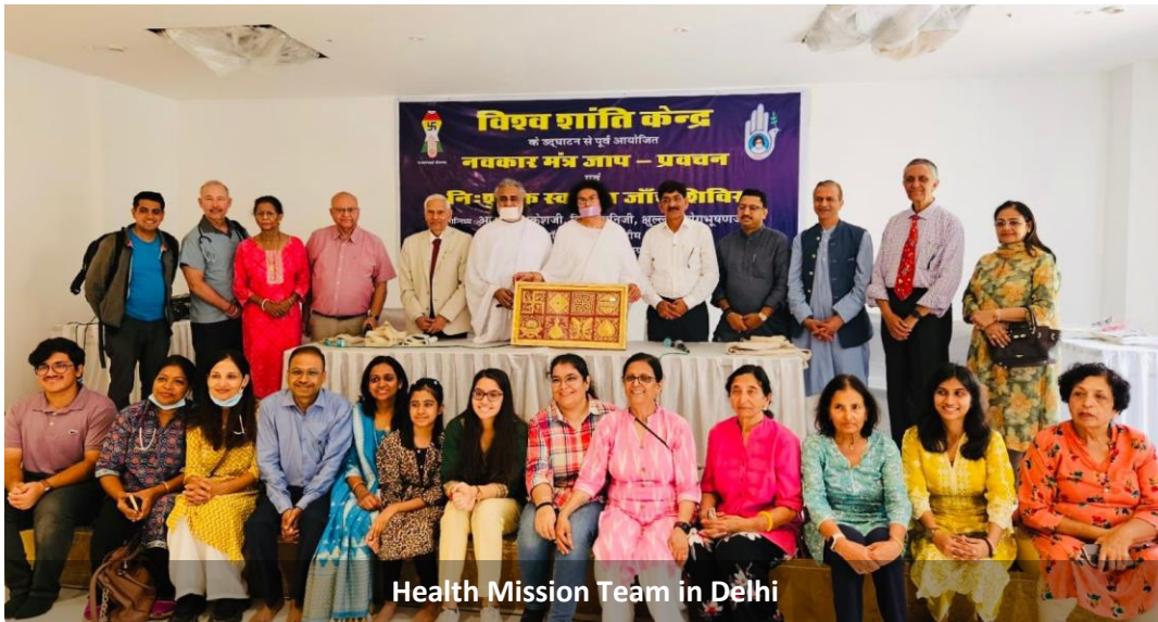
Health Mission Team in Delhi