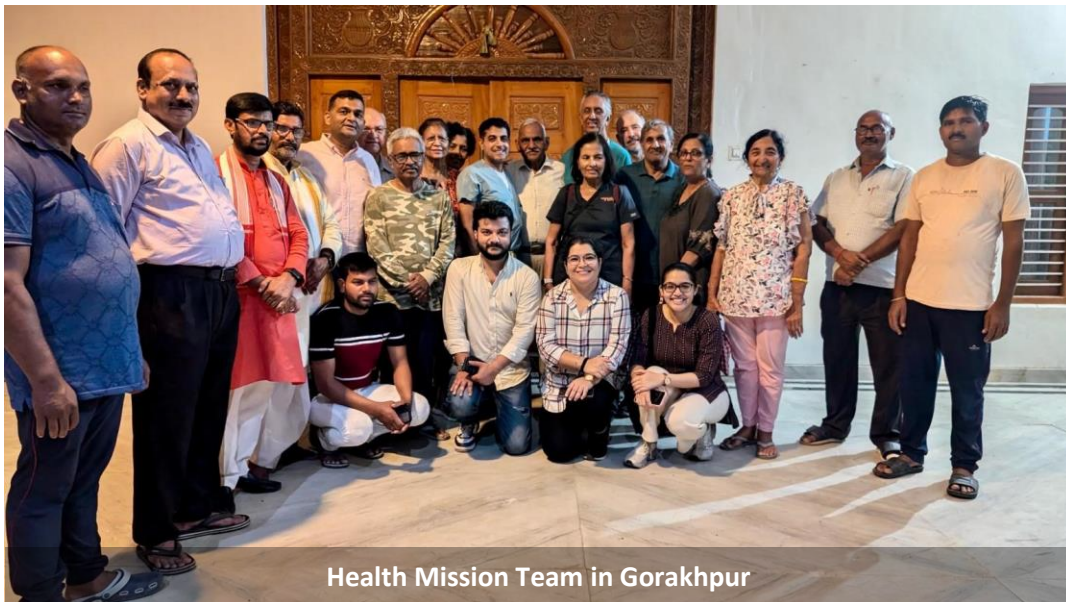
Health Mission Team in Gorakhpur