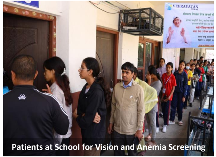
Patients at School for Vision and Anemia Screening