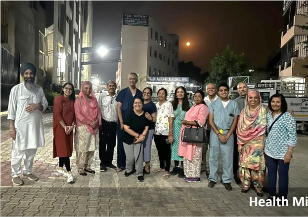
Health Mission Team in Chandigarh