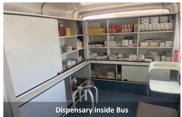
Dispensary inside Bus