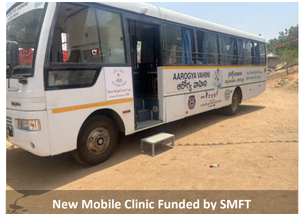
New Mobile Clinic Funded by SMFT

Through this collaboration with Dava Cana, SMFT is making significant steps towards its vision of providing high-quality healthcare to rural and underprivileged communities and now, thousands of people in Narayanpet District can get the healthcare they need.