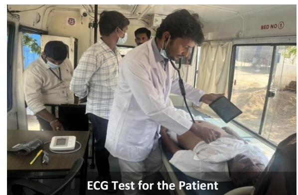
ECG Test for the Patient